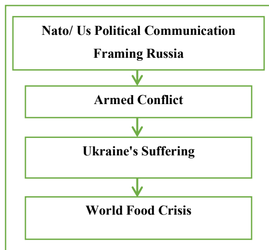
Figure 1. Putin's political news framing model in Tempo Magazine

equipment is mostly imported from Russia. This means that Russian-Myanmar political relations can promise a military system to both sides. The following is Putin's Political Communication Model in Tempo Magazine.