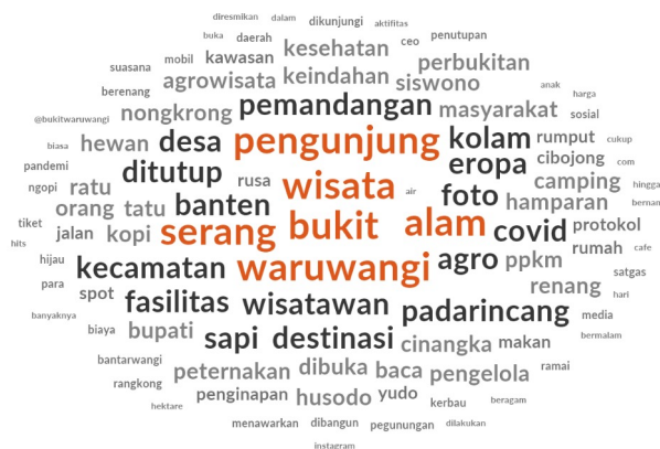
Figure 1. Word Cloud Online Media News about Bukit Waruwangi

The focus on the theme of online media coverage above shows how Waruwangi Hill has become a natural tourist destination in Serang. The media also recognize 'the otherness' of destinations in the Banten region as the distinction of Bukit Waruwangi.