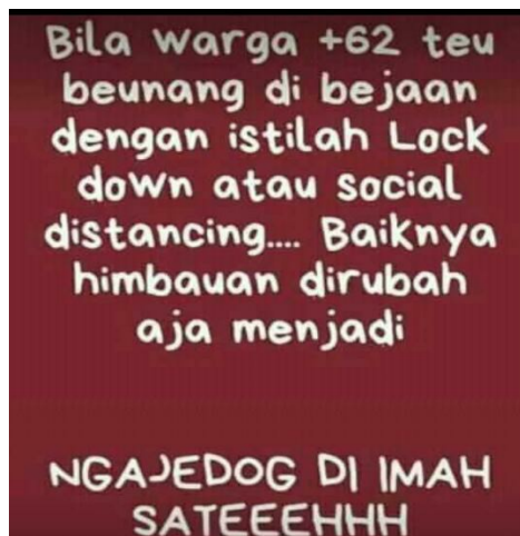
Figure 7, Meme Appeals for Silence at Home

Individuals who make memes or humor like this could be motivated by leisure, entertainment, to pique because people ignored government appeal.