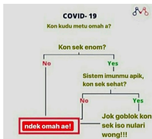
Figure 5. Meme Appeals for Silence at Home

Figure 4 and 5 are uploaded on various social media (Instagram, Facebook, Twitter, Whatsapp, etc.) which are puns or memes of the information submitted by the account @ kawalcovid19.id. In