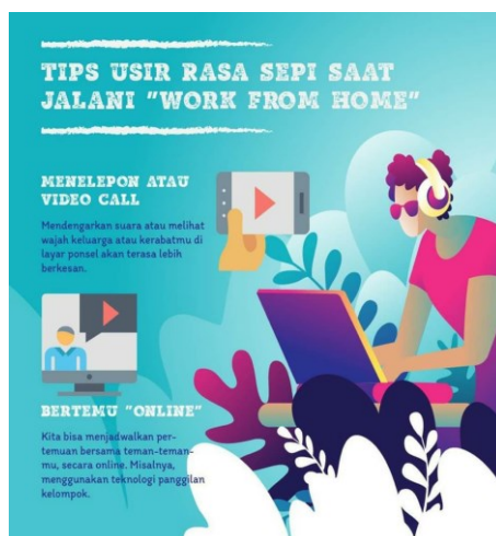
Figure 2. Tips to Banish Loneliness when Silence and Work from Home

social distancing in the community is very widely used in a variety of information, both issued by the government, media, schools, NGOs, and the community.