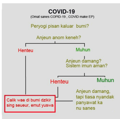
Figure 4. Meme Appeals for Silence at Home

Figure 4 and 5 are play information or memes from Figure 3. Both of these data show an appeal to stay at home aimed at young children. Some young people think that they are young and have good endurance. Therefore, they are not worried about doing activities outside the home. This is not in accordance with the recommendations of the government and society in general. Figure 4 shows the data play using the language. Meanwhile, figure 5 shows a play by using the Java language, Java dialect easterlies.