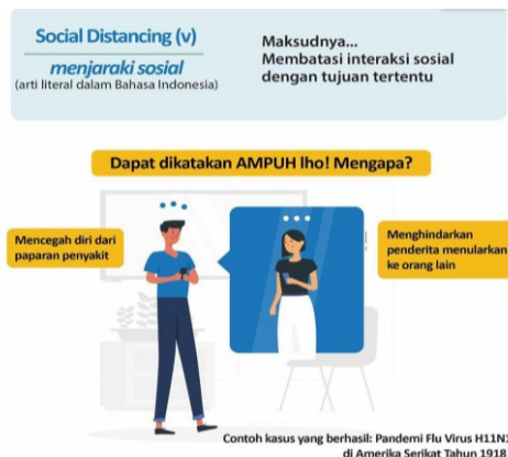
Picture 1. Explanation of Social Distancing

Meanwhile, the information presented by the language of daily life that tend to be rough and using a style of humor, are likely to be understood by the lower social class groups.