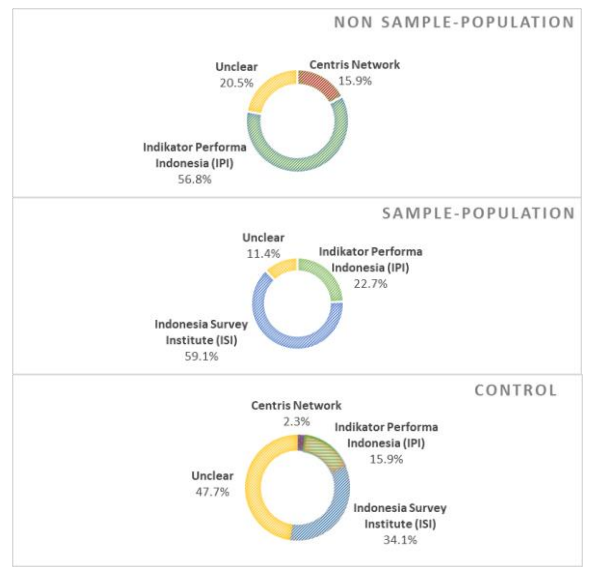
Figure 1. Comparison of Respondents' Response on Sample-Population Survey Frame

Based on the experimental study carried out, it is known that the frequency of respondents' responses differs. In the non sample-population frame, 56.8% of respondents replied that they believe the survey result of Indikator Performa Indonesia (IPI) more than that of Centris Network, which was only believed by 15.9% of respondents. The condition differed when the respondents were given sample-population frame, wherein only 22.7% of respondents believed in the survey result published by Indikator Performa Indonesia (IPI), while as many as 59.1% of respondents believed in the survey result of Indonesia Survey Institute (ISI) more (see Figure 1).